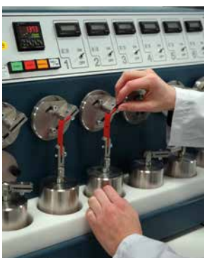
Belt flexion performance