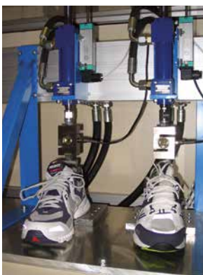
Heel ageing performance